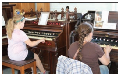
Organ Building • Toy Displays