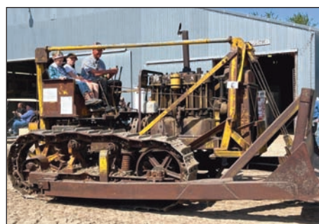
• Diesel and Gas Engine Displays • Old Gas Tractors and Crawlers