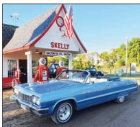
Toy Displays • Large Model Railroad Display • Old Cars