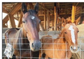
• 110-Ton Wheelock Stationary Steam Engine • Blue Ox Tractor Pull