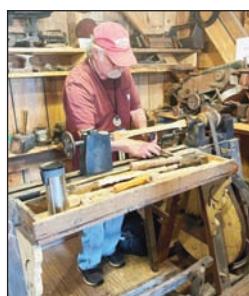
Old Fire Engines and Trucks • Working Vintage Shoe/Leather Repair Shop. Demos every day