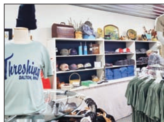
Hunting Heritage Building