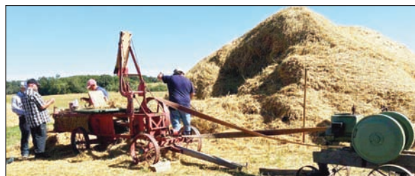
Threshing • Corn Shelling • Grain Cleaning Earth Moving Display • Organ Building